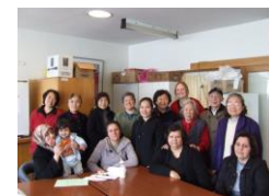
Some of our ESOL students